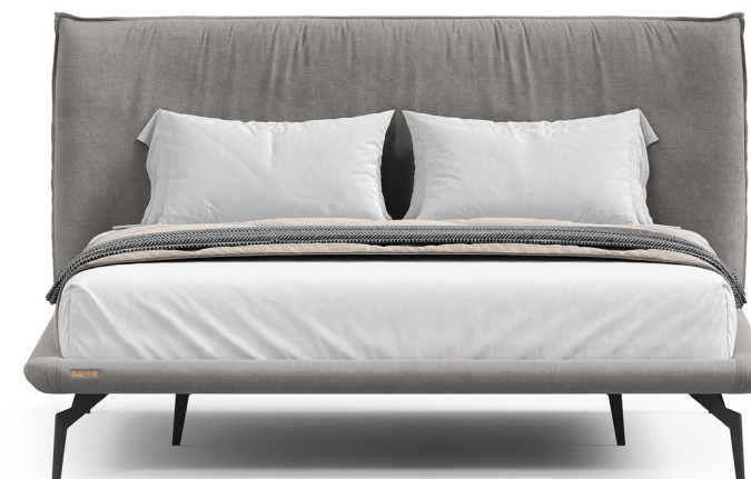
* side view

The Midway bed is available in sizes from 0.9 × 2 m to 1.8 × 2 m, allowing you to choose the optimal option according to your bedroom space.